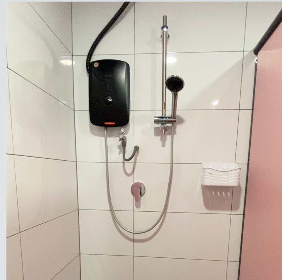
Hot Shower Facility