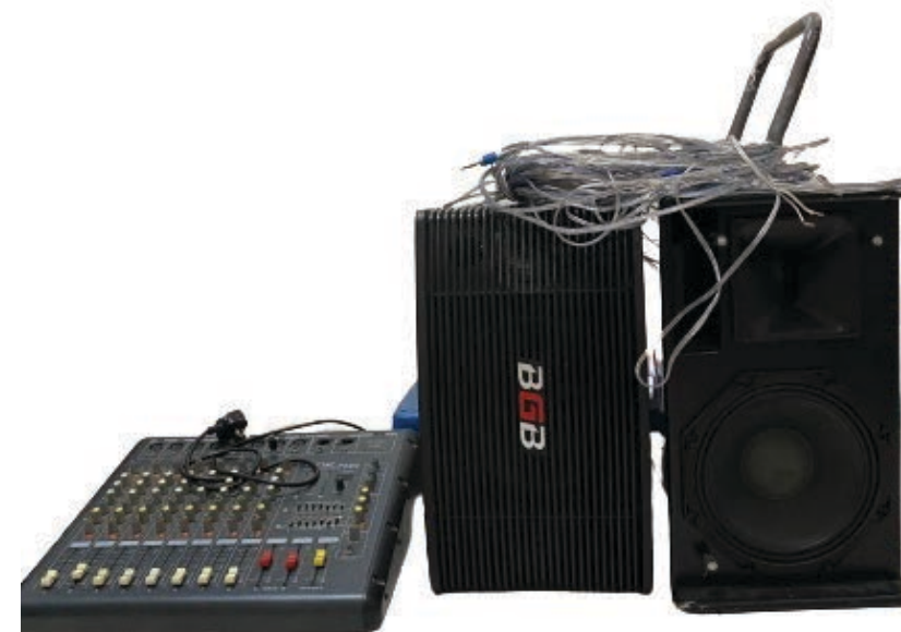
PA System RM200