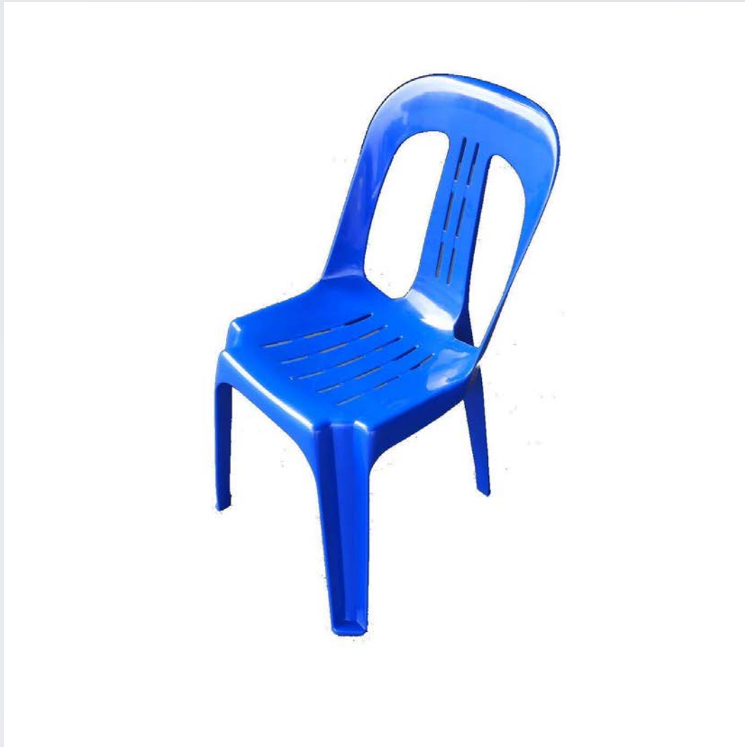
Chair 20 units RM5 per chair