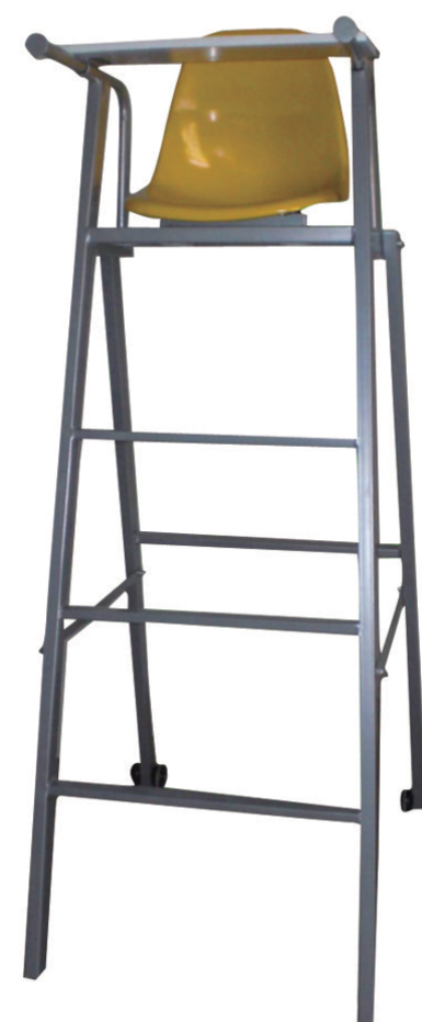
Umpire Chair 7 units RM50 per umpire chair