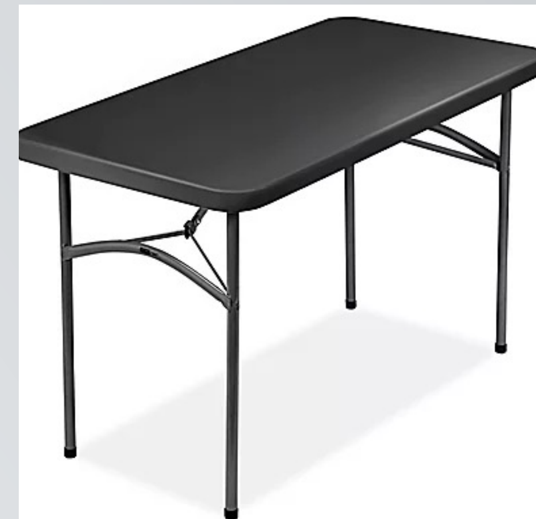
Table (120cm x 60cm) 2 units RM10 per table